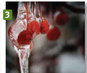
Submitted by Jan Salupen

See back for details on how to enter your favorite photo.